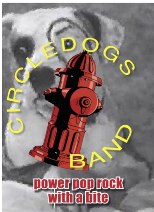
Saturday Evening Entertainment