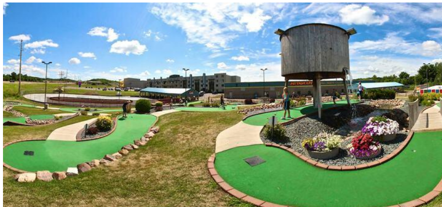
Mini-Golf Tournament – Saturday Afternoon