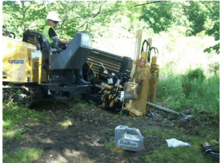
Directional boring machine in operation