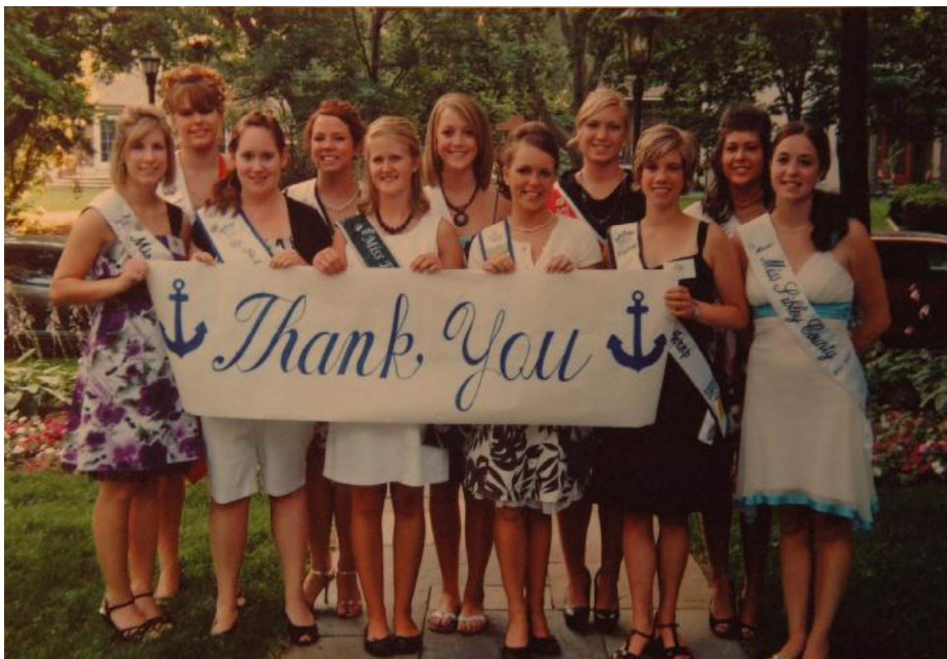
Minnesota Midwest Queens

This is a great service the Minnetonka Power Squadron provides annually for our greater community. Thanks to all who participated. It truly was a blast!