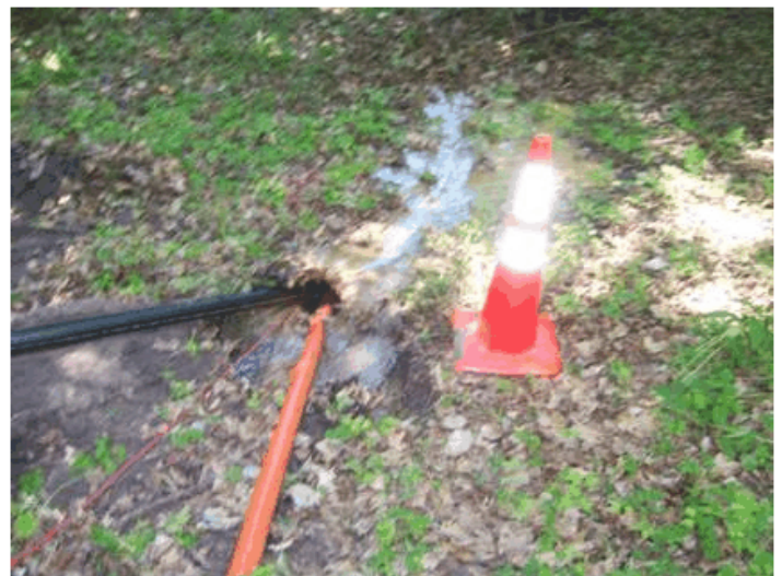
Line used to pull the cable