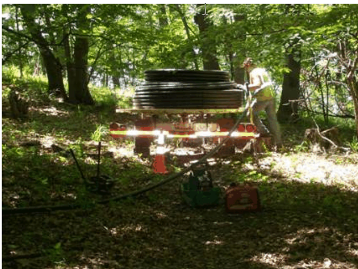
Feeding the PVC through the bore hole