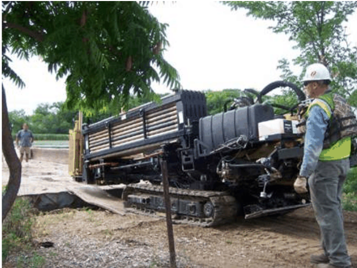
Directional boring machine